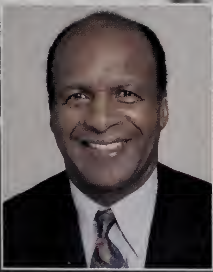
Jesse White Secretary of State